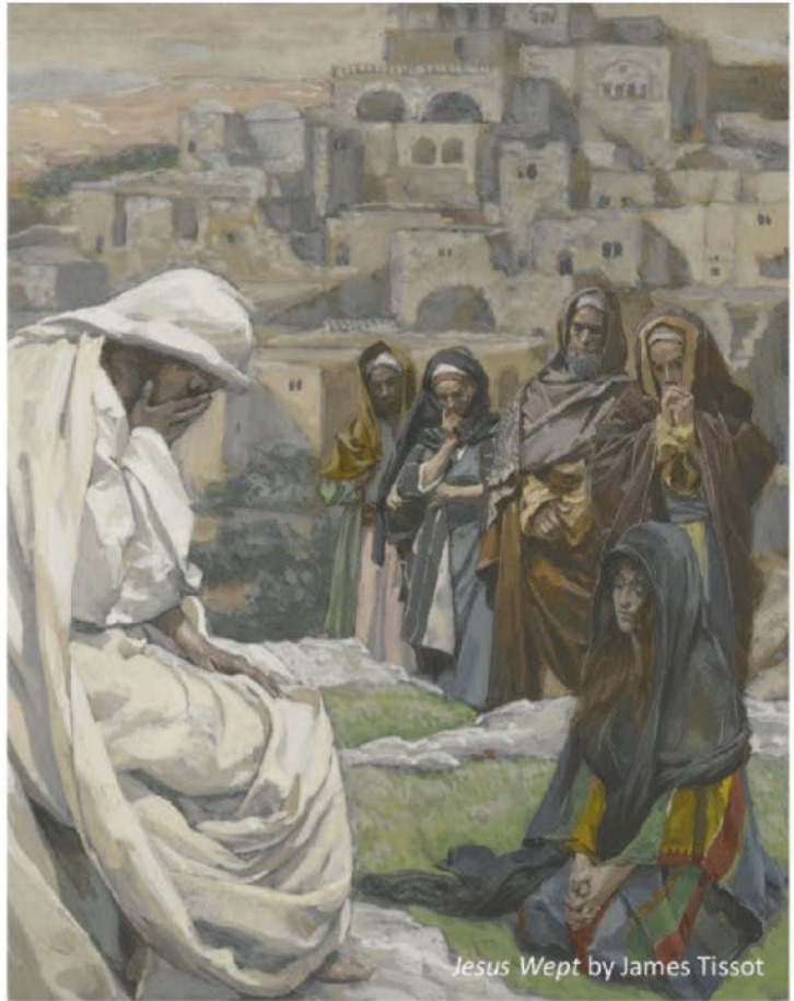
Jesus Wept by James Tissot